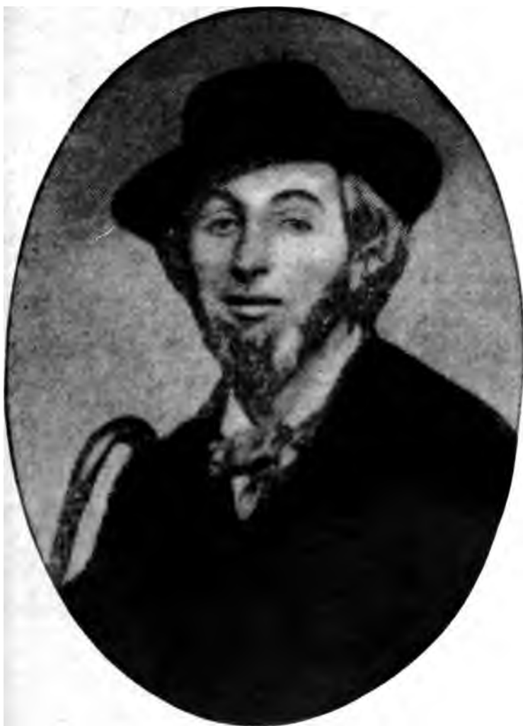
WHITMAN'S EARLIEST PHOTOGRAPH (1840)

Enlarged, from an old newspaper clipping, original and plate being undiscoverable.